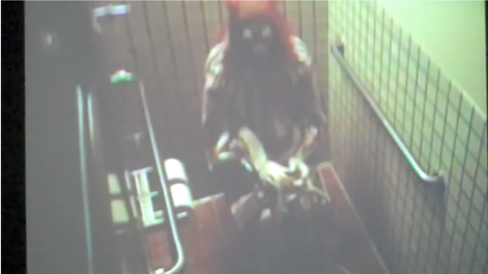
Clown Torture (1987)

Practitioners - Bruce Nauman - Clown Torture (1987)